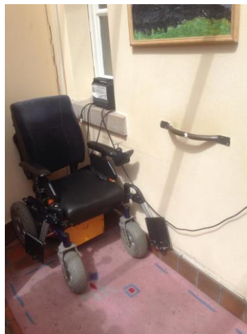
My electric wheelchair on charge

Since my first electric wheelchair in 1984 they have changed a lot and become a lot more sturdy which means I can go everywhere in my wheelchair which is a great feeling.