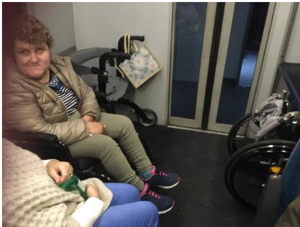
Train journey home

We had been told in Edinburgh that there would be no problem getting home as we were not all coming back together. Passenger assistance told us that the 3 wheelchair users would all get on the same train.